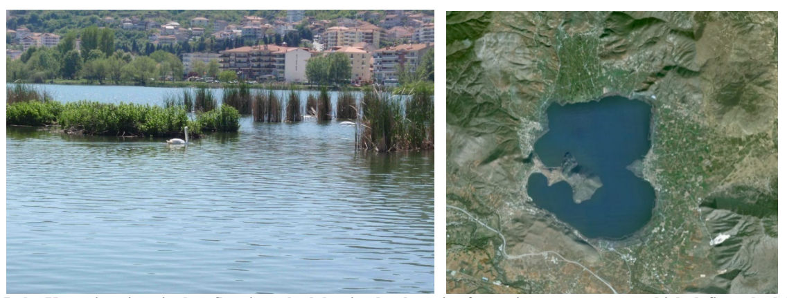
Fig. 1 Lake Kastoria: nine rivulets flow into the lake; its depth varies from nine to ten meters which defines the lake as a shallow one.

preservation/restoration of Lake Kastoria [3, 4]. The WTP dependence on (i) external diseconomies; (ii) the expectations for property values' rise as a result of the restoration; (iii) the proximity of interviewees' residence to the lake; (iv) the opinion of the interviewee on the time [3, 4] and money spent to visit the lake; (v) the time and money the interviewees spent to visit the lake, as well as other dependencies (all taken as independent variables) are estimated by means of logit, probit, logistic and linear regression models [5, 6].