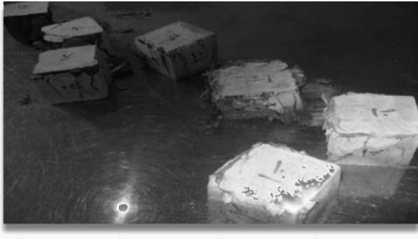
Picture 5- the broken samples with glass fibers