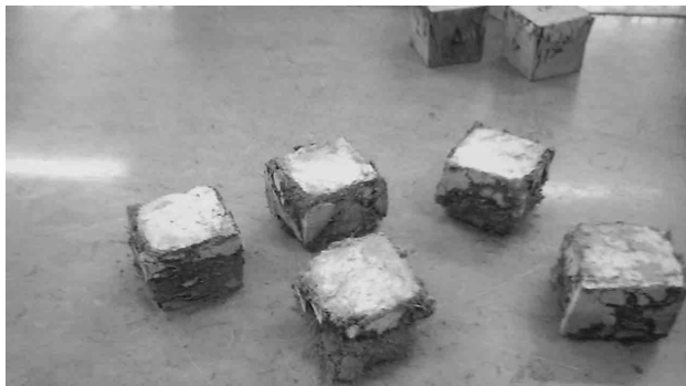
Picture 6- the broken samples without aramid fiber