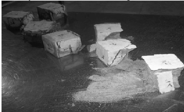
Picture 2-broken samples without fiber addition.

Picture two shows the produced samples. As it appears in the picture, the samples are broken conically, which is an ideal breaking of concretes.